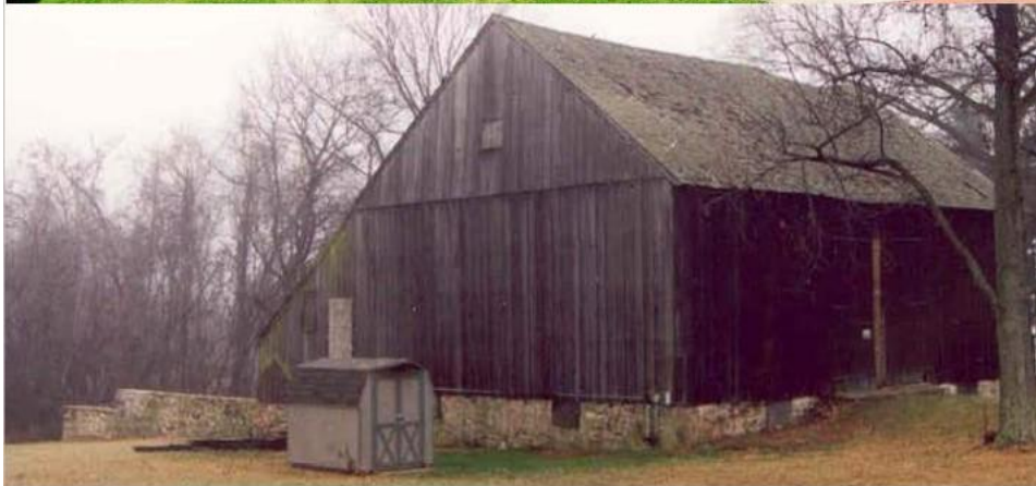
Morris Barn, demolished in 2002 due to structural failures beyond reasonable repair.